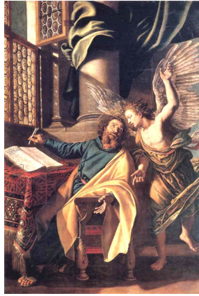
St Matthew, Apostle